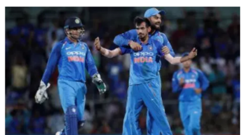
MS Dhoni: The man leading India from behind