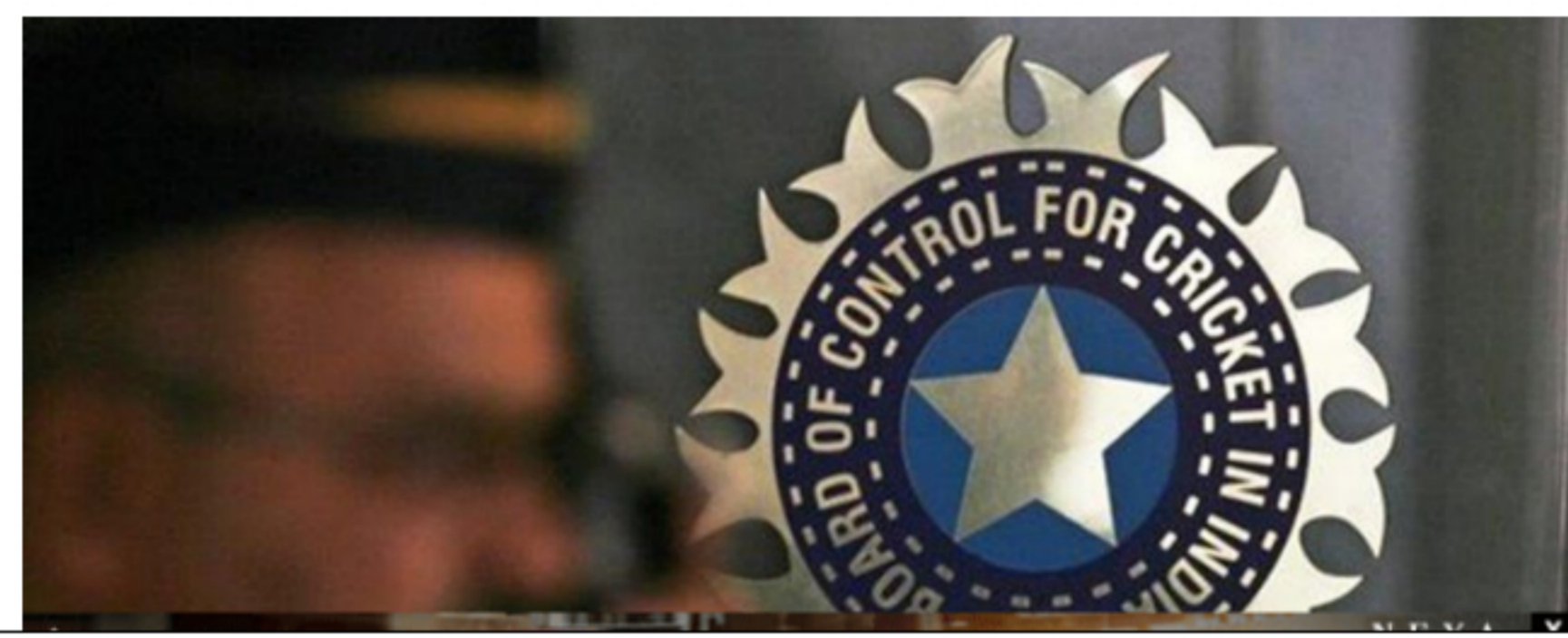
BCCI has not been attracted by Indoor Cricket World Cup so far.

By: PTI | Dubai | Published: September 16, 2017 2:17 pm