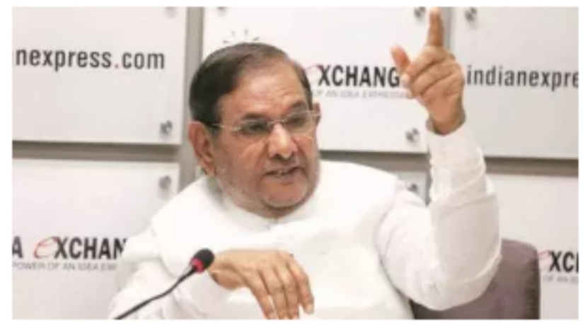
Will align with Congress, Left in Gujarat polls: JDU's Sharad faction