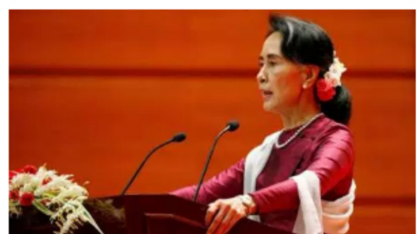
Aung San Suu Kyi says Myanmar ready to begin verification process for refugees who wish to return